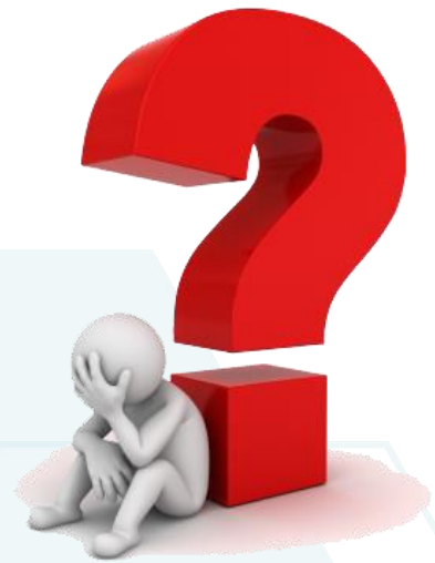
SYSTEM IN ALARM! WHY?

To determine the cause of your alarm LED showing an error, you can disconnect the indoor antenna / service line from the “ INDOOR ” port of the repeater. If the LED does not change to green, then it's either a case of the input signal after passing through the pre-amp is now too strong or there is another antenna within a few feet of your donor antenna that's causing the interference. If there are no other antennas close by, at this point you must attenuate the downlink DIP switches by 2dB increments till the LEDs turn green again. ( Switches 1-5 ) After this, you must match the same attenuation value on the uplink side ( Switches 6-10 ). Once complete, please reconnect the indoor antenna / service line again. If after connecting the indoor service line the alarm LED changes back to amber or red then signal oscillation is taking place.