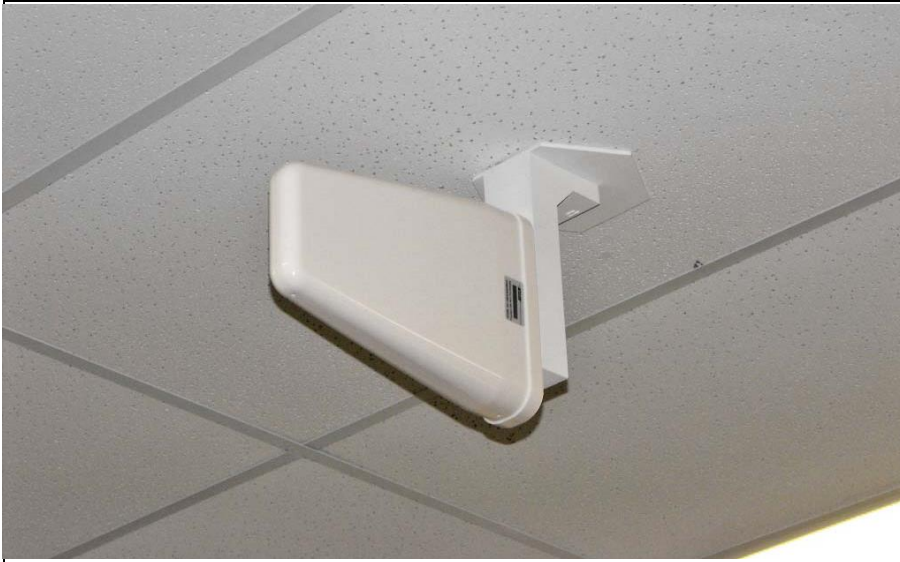
Application Image #1